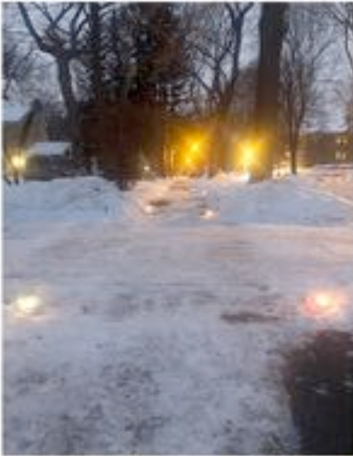
Prospect Park New Years Eve Luminaries.